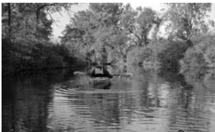
Kayaking on the White River