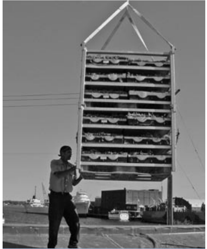
Plants for the green roof on AWRI's new boat storage building are delivered

Much like the Prosperity Index, these will be created with all of Muskegon County residents in mind. The Principles include basic assumptions and ethical rules used in guiding the development of the Standards. The Standards, in turn, will identify specific actions steps needed to attain both short term and long term goals.