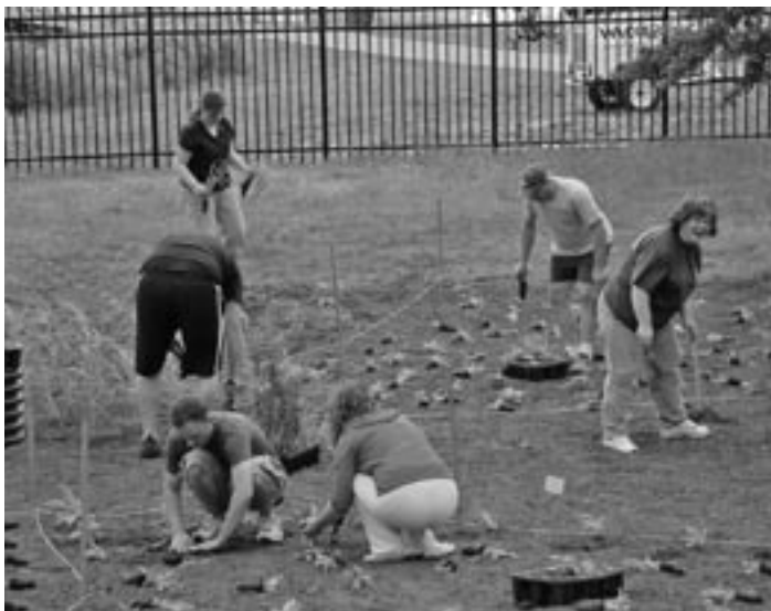
AWRI staff plant seedlings in the rain garden, which was built to treat storm water runoff from the cement parking lot

Two products currently under development are the Sustainability Principles and Sustainability Standards.