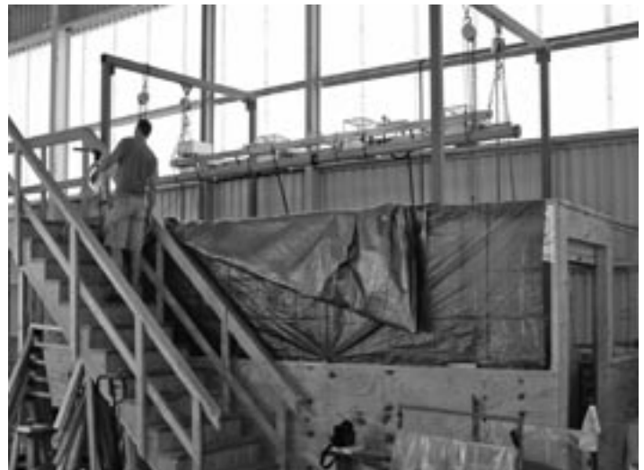
Outside view of Overland Flow Laboratory