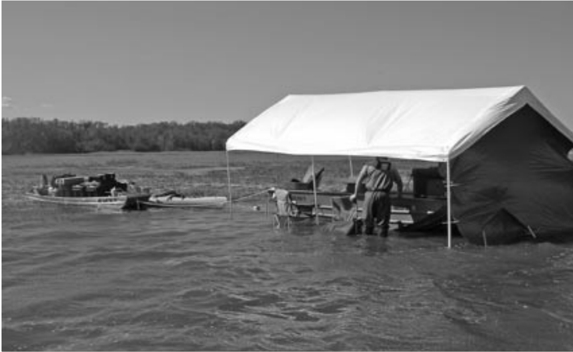
A temporary “home base” in the water