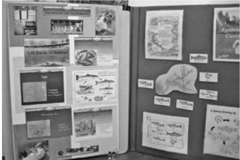
Salmon in the Classroom makes science fun and accessible for students