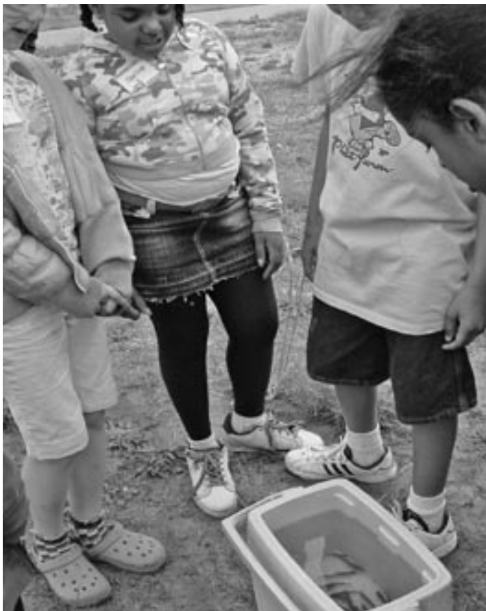
Theodore Roosevelt Elementary students observe the small salmon that are soon to be released