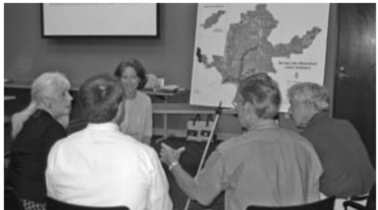
Stakeholders discuss sources of storm water in the Spring Lake watershed

For more information, please visit www.gvsu.edu/wri/reintherunoff , or contact Elaine Sterrett Isely ( iselyel@gvsu.edu ) or Alan Steinman ( steinmaa@gvsu.edu ) at AWRI. Funding for this project is provided by Michigan Sea Grant College Program.