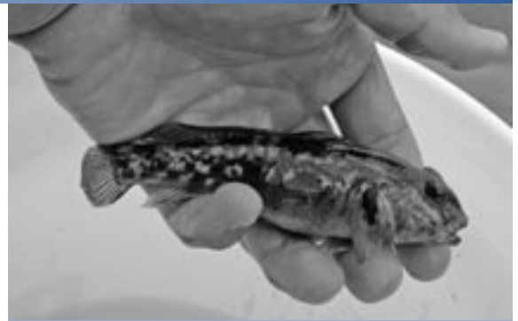
A round goby