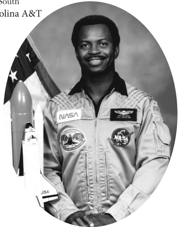
Ronald E. McNair, Ph.D.

After his death in the USS Challenger space shuttle accident in January 1986, members of Congress provided funding for the Ronald E. McNair Post-baccalaureate Achievement Program. The goal is to encourage low-income, first generation students, as well as students who are traditionally underrepresented in graduate schools, to expand their opportunities by pursuing graduate studies.