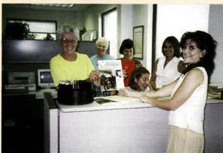
Smiling faces greet visitors at the new Mackinac Hall.

The School of Education moved from AuSable Hall into its new Allendale campus home in Mackinac Hall for the 1998 Fall Semester. The new facility provides a centralized location and better access between offices and classrooms.