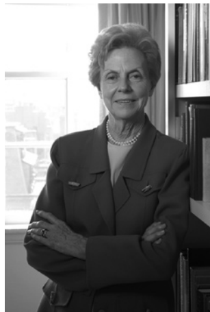
Jill Ker Conway

• Legendary work by a pair of American giants is featured when music and dance faculty members and students present "Appalachian Spring" on Monday, November 1, at 8 p.m. in the Louis Armstrong Theatre, Performing Arts Center. Through a special licensing agreement