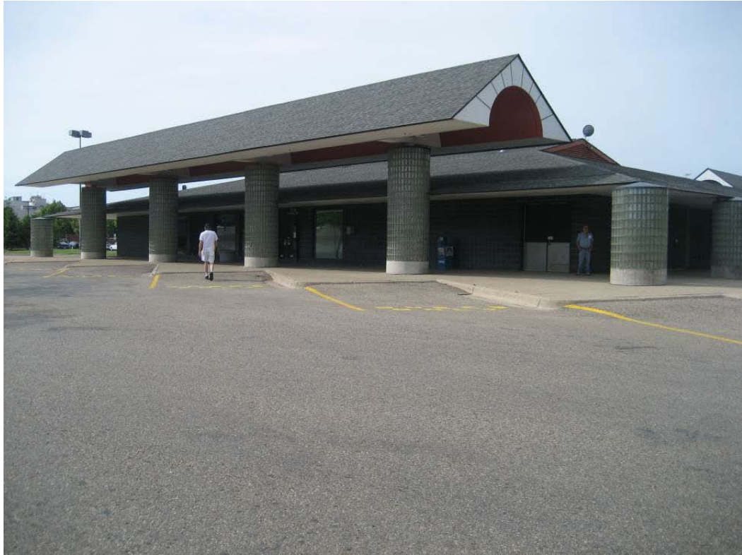
Battle Creek. This modern station was built in the 1980's near downtown Battle Creek. It serves local and intercity buses as well as Amtrak.