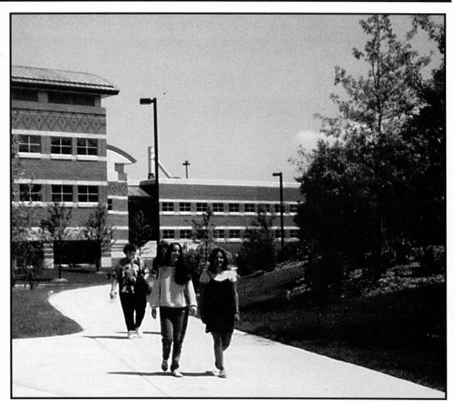
component. "He urged At right, the newly-named Padnos Hall is scheduled to be us to create the Padnos completed in December.