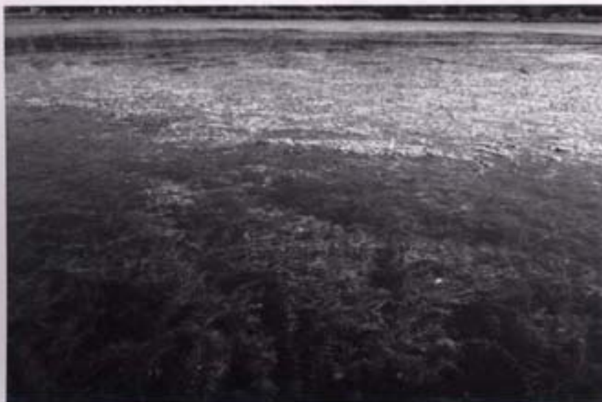
Many parts of White Lake are overrun with excessive plant growth caused by nutrient loading.

The reason for the increased plant growth is not a mystery. Basically, the plants are getting more light, thanks to the clearing of the water column by zebra mussels, and too many nutrients — what scientists call “nutrient loading.” What is not well known, though, is how those nutrients are finding their way into the lake.