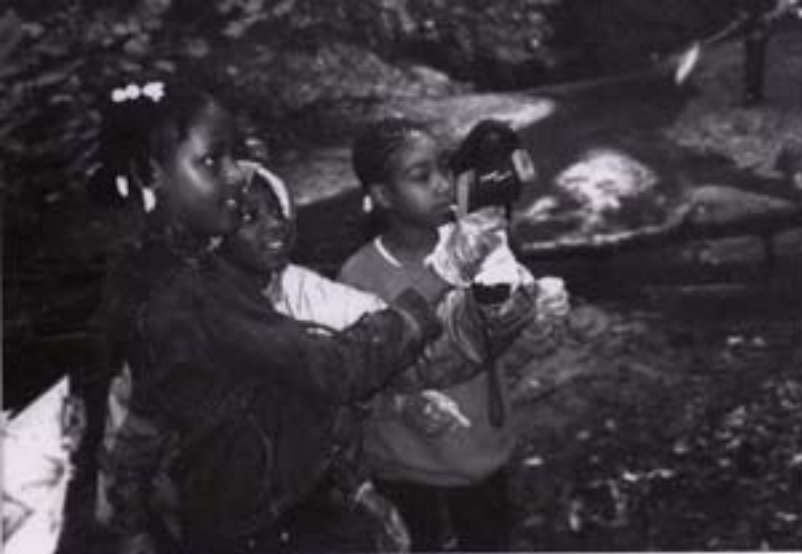
AWRI staff helped to train students, such as this group from Muskegon Heights, in environmental monitoring.