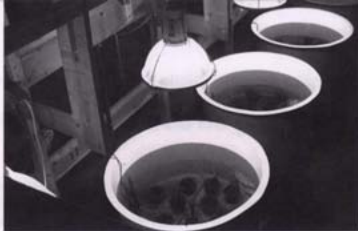
Nutrient experiments in the AWRI mesocosms.