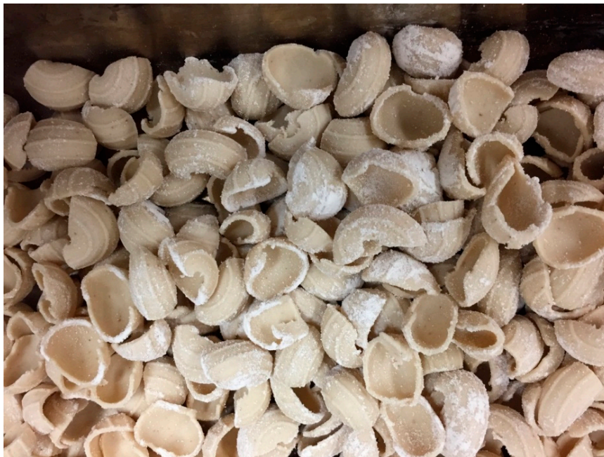
Figure A1. Breadfruit pasta (Orecchiette).