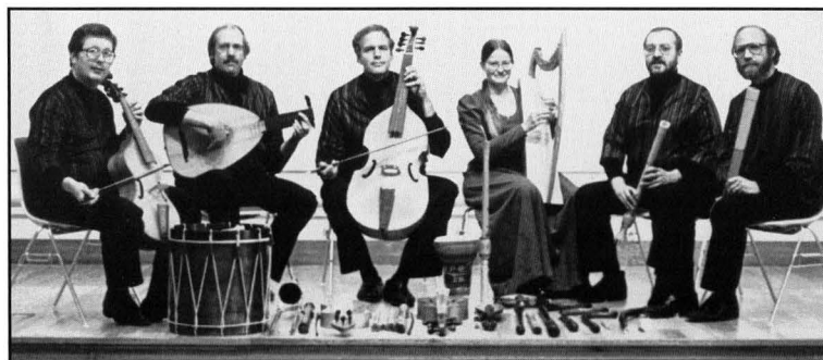
The Early Music Ensemble

As part of Grand Valley's Shakespeare Festival, the Early Music Ensemble will perform in the Cook-DeWitt Center at 12 noon on Thursday,