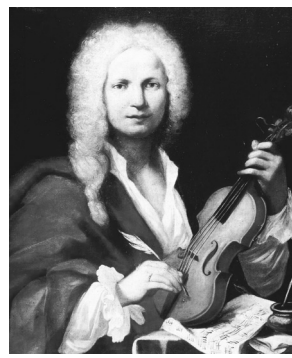
The University Arts Chorale and music faculty members and students will perform 'Gloria' on December 5 at Fountain Street Church.

The great bulk of Vivaldi's music lay virtually unknown until after the end of World War I. In 1926, through a chance discovery of nearly 400 unknown manuscripts found among crates of old documents up for sale, the music of this great Italian Master was unleashed upon the modern world.