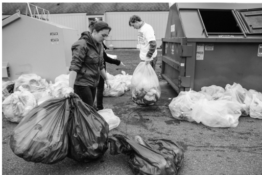
Grand Valley took second place in the national Game Day Challenge, which aims to promote waste reduction at football games.

At all seven home football games, more than 144 students and staff members volunteered to compost and recycle 4,000 pounds of trash, which saved about 71 percent of the waste stream from going to a landfill.