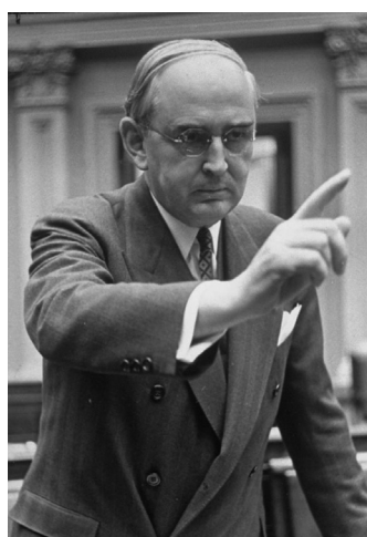
A documentary about U.S. Sen. Arthur H. Vandenberg will premiere on WGVU Wednesday.

The documentary also will be shown during two public events on Thursday,