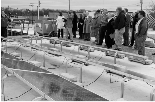
Grand Valley is part of a partnership to bring renewable energy technology, like these solar panels, to organizations that house and serve income-eligible people in Muskegon and Oceana counties.

Muskegon Oceana Community Action Partnership, Inc. was awarded a $3.2 million grant from the U.S. Department of Energy through a Sustainable Energy Resources for Consumers grant. It allows several Michigan contractors to install one or more systems at residential and income-eligible group care facilities. Installations may include hybrid domestic hot water, solar domestic hot water, solar hot air and solar photovoltaic systems in single- and multi-family units. Grand Valley's Michigan Alternative and Renewable Energy Center provides technical assistance and serves as a resource for the project.