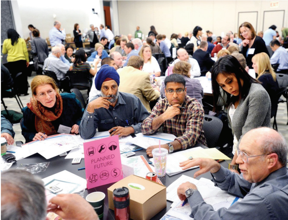
FIGURE 2: YouChoose Santa Clara County Forum at Microsoft, April 2011

On the other hand, nonprofit partners were skeptical of government's ability to effectively collaborate and engage residents given past experiences. In addition, more players (often up to 15 people, mostly from the government agencies) were now involved in the design of the forums, which increased the complexity and time required for planning.