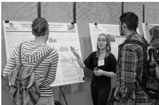
Students can register for Student Scholars Day through February 14. Last year, more than 600 students were involved.