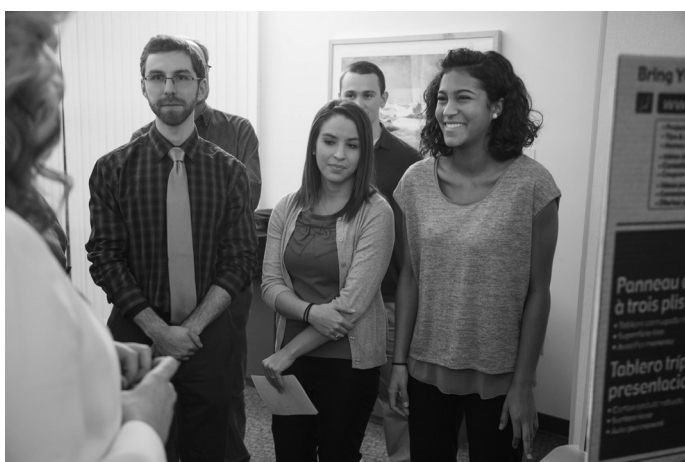
Students present their work to Spectrum Health Innovations staff members at an event in December.

School of Engineering through a collaboration with Spectrum Health Innovations, a subsidiary of Spectrum Health that helps health staff develop and launch original ideas, including health care products and technologies. Physicians and medical staff members come to SHI with ideas. Through the SHI/GVSU collaboration agreement, they work with students who are charged with developing the ideas and building prototypes.