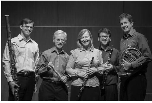
Grand Valley Winds will kick off the winter semester Arts at Noon concerts on January 27.