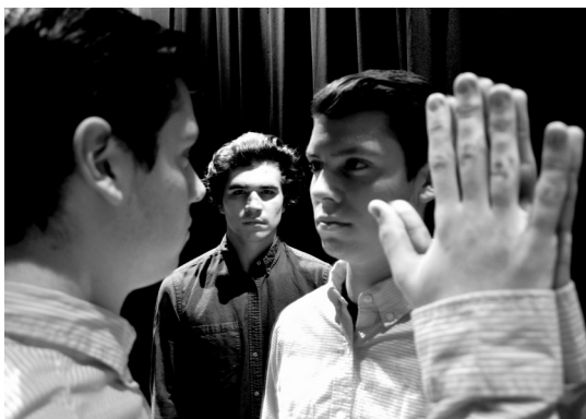
GVSU Opera Theatre will perform 'Godspell 2012' beginning February 5 in the Louis Armstrong Theatre.

For the past two seasons, Schriemer has cast alumni in each