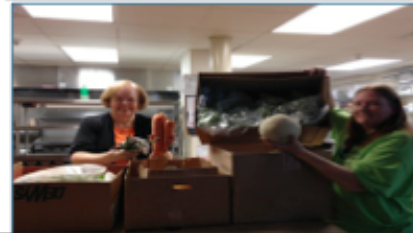
(Shots of distribution to soup kitchens)

Gleaning is the gathering of leftover crops after a harvest, by collecting unused produce from farms and farmers markets, HGI is able to distribute it to the community.