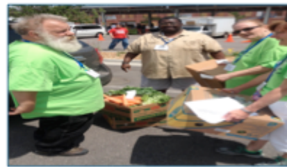
(Shots of Gleaning at the Farmers Market)

Narrator: The Heartside Gleaning Initiative works with local farmers to not only feed the Heartside district, but educate them on benefits of a healthy diet.