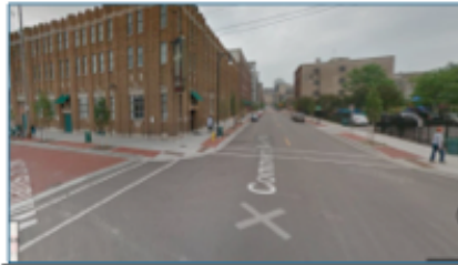
(Shots of Heartside District)

Narrator: Finding affordable healthy food is an issue in many communities across the nation, communities with this problem are known as food deserts.