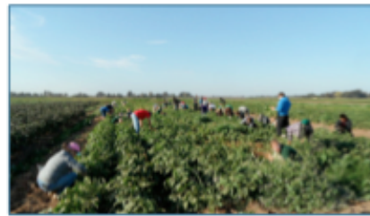
(Shots of Gleaning Efforts on Farms)

Narrator: Grand Rapids' Heartside is no exception, 45% of its residents are under the poverty line and 80% suffers from food scarcity. Luckily, there is an organization