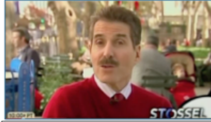
(Narrator walking around Heartside)

Narrator: Finding affordable healthy food is an issue in many communities across the nation, communities with this problem are known as food deserts.