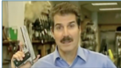
(Narrator in a soup kitchen)

Narrator: Grand Rapids Heartside District is home to most of the soup kitchens in the city, which are often filled with highly processed unhealthy foods. Much of the gleaned