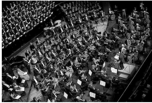
The Grand Rapids Symphony will perform during Arts at Noon on February 3.

"It is especially important for our students to hear the symphony as often as possible because it gives us a model of excellence, as well as a most enjoyable aesthetic experience when they come for their yearly concert," he said.