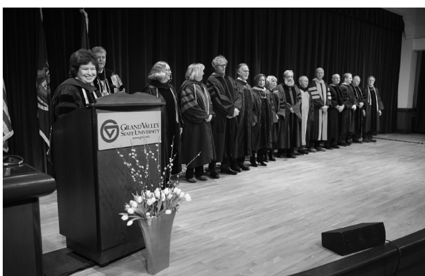
The Faculty Awards Convocation from 2015 is pictured. This year's event is set for February 4.

The annual Faculty Awards Convocation will include presentation of a new award and, for the first time, recognition of this year's faculty Glenn A. Niemeyer Award recipients.