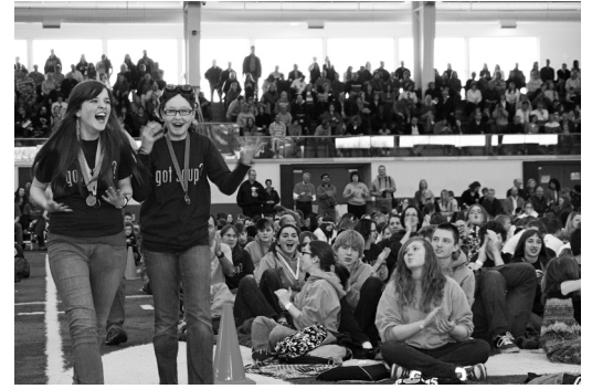
More than 1,500 students will compete in the annual Science Olympiad tournament March 19 in the Fieldhouse.

For more information, visit www.gvsu.edu/clasadvising .