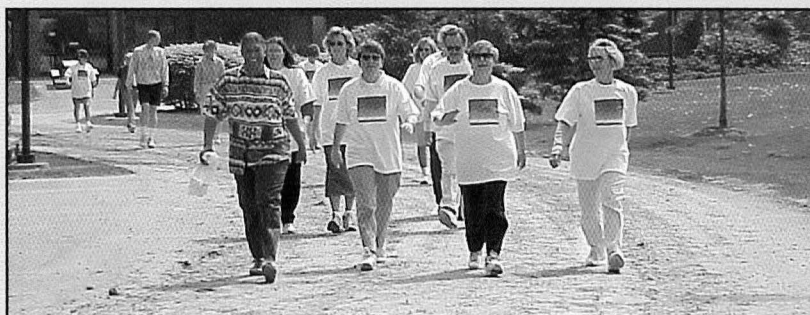
Nearly 90 faculty and staff members took part in the observance of National Employee Fitness Day on the Allendale campus on May 17 by participating in the One-Mile Fun/Walk Run.