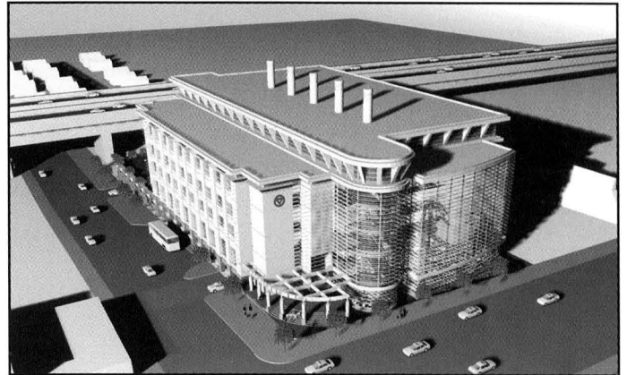
An artist's rendering of what the Health Professions Building might look like. (View northeast from Michigan and Lafayette.)

and use statement for GVSU's Lake Michigan Center project, which will establish a new facility on Muskegon Lake for the Annis Water Resources Institute. Groundbreaking for that project is scheduled for June 15.