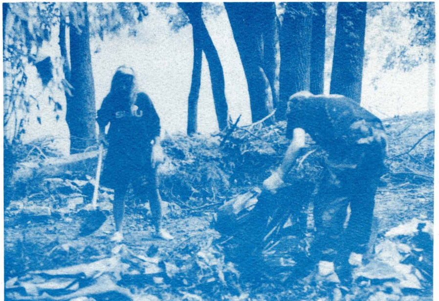
Students picking up trash at a Water Resources Institute sponsored stream clean up along the banks of the Grand River.

Data can also be used at the local government level. "The City of Austin, Texas passed a ban on