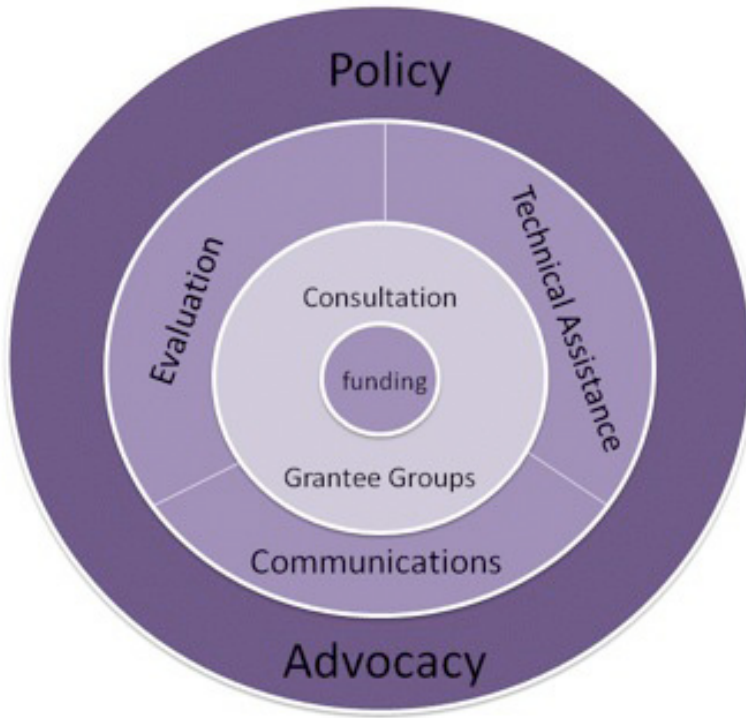
FIGURE 1 The Health Foundation's Framework for Sustainable Grantmaking

Many of our grantees' health-related services are funded through Medicare, Medicaid, and other government programs. This means that the financial sustainability of programs can be greatly affected by the political climate and state and national priorities. We have learned that grantee organizations and, in turn, their consumers are adversely affected if government policies change to decrease access or if funding streams are eliminated. Unfortunately, limited resources and lack of political experience make it difficult, if not impossible, for many of the foundation's grantees to advocate for their clients. To respond to these challenges and an increasingly complex political landscape, the foundation collects and disseminates data on pertinent health-policy topics, hosts workshops that increase grantees' understanding of work in the policy arena, and, when appropriate, funds local and state groups that inform policy. The foundation also encourages grantees to expand their revenue sources beyond traditional government funding, and provides assistance to grantees that are exploring ways to generate