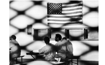
Initiative of the Davidson County Juvenile Detention Center keeps up with their studies through a partnership with Metro schools.