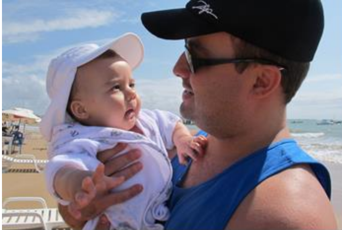
Middle class 30 year-old architect with his 8 month-old daughter at beach at Salvador City, Bahia, in Northeastern Brazil.