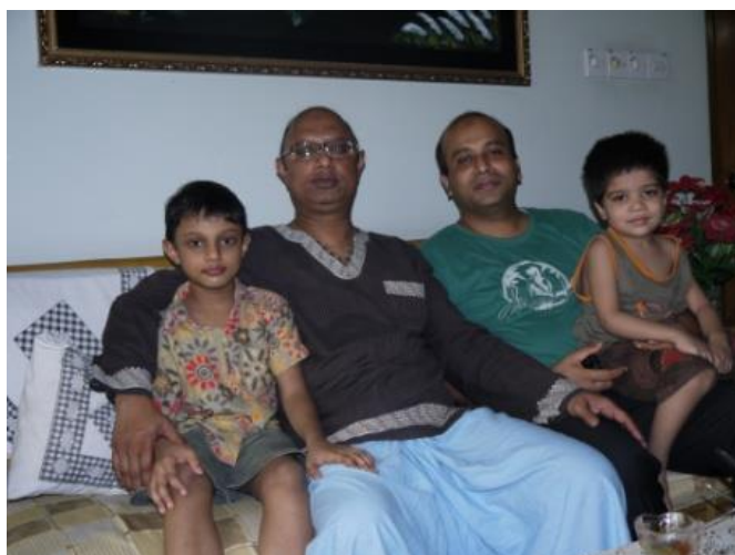
Two affluent, urban (Dhaka), educated fathers (banker and businessman) with their sons at a family gathering.