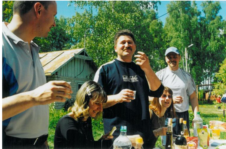
Russian fathers and mothers drink vodka at school reunion in public park (Kaluga).