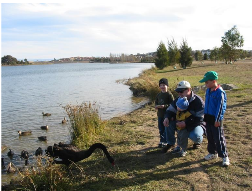
An upper middle-class father in his 30s, lakeside with children ages 2, 6, and 8 in Canberra. Owing to expansive geography and mild climate, outdoor recreation is popular with fathers.

First, Smyth et al. (2013) claimed that in demographic terms Australian fathers and families have many similarities to their counterparts in other Western societies, e.g., declining marriage rates, marriage and childbearing at a later age, decreasing family size, and increasing numbers of social fathers.