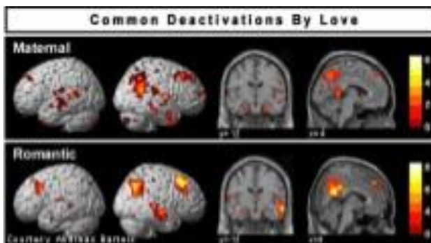
Figure 1. Patterns of brain activity by love (courtesy of A. Bartels)

The researchers do not report any cross-cultural differences in the participants' experience of passionate love since their sample size for each culture was too small to allow for statistical inference regarding this. However, given that also maternal love gives almost identical activation patterns (Bartels & Zeki, 2004), and given that the results are highly similar to those in several other species (see Figure 1), Bartels believes it is highly likely that these core regions that they report to be modulated by love will be preserved across cultures and even species (personal communication, October 6, 2014).