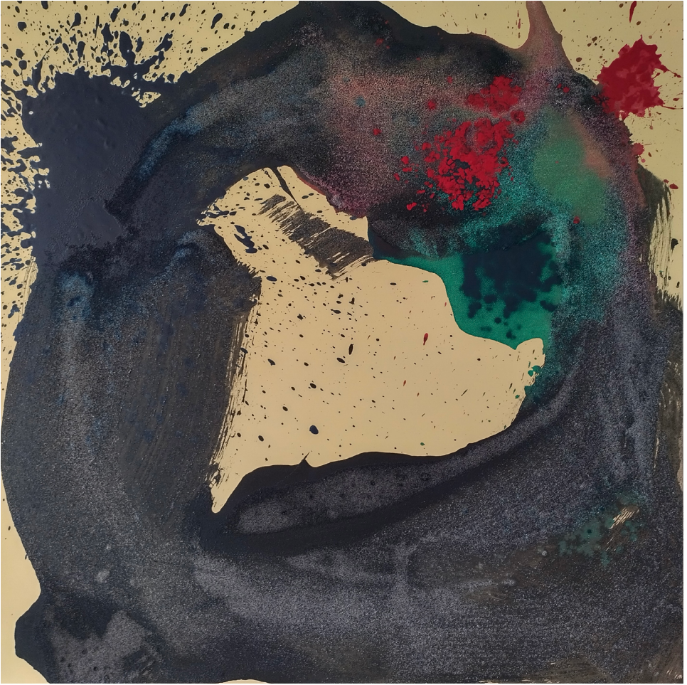
With This Love (2022). Acrylic on Canvas.