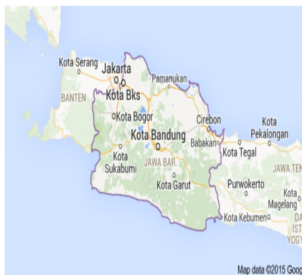
(c) Map of West Java where Sundanese live