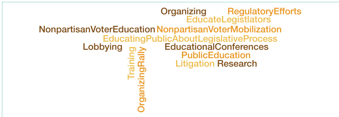
FIGURE 1 13 Common Tactical Activities to Support Advocacy