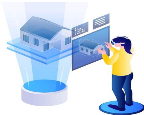
Fig. 2: Woman looking at house size with virtual reality

People have always been on the move, but their motivation has changed over a period of time. Traveling, as well as the habit of writing about vacation excursions, has an elongated history (Shackley, 2006). "VR" stands for virtual reality technology. There were only a few military and academic laboratory concepts at first. With the continued development of computer and sensor technology until the turn of the century, it progressively moved from the workplace to the practical stage and was widely used in various spheres of human existence, resulting in a new situation (Schmitz S. & Tsoygou D.L., 2016). Virtual tourism is a computer-generated environment that allows users to engage with various stimuli and experience landscape and sound effects through virtual media to simulate being in a certain location (Huang et al. 2013).