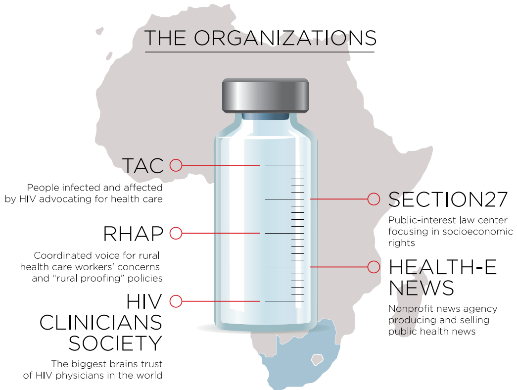
FIGURE 1 The Organizations

Act. The primary civil-society actors engaged in holding government accountable for quality health-service delivery are community-based and nongovernmental organizations.