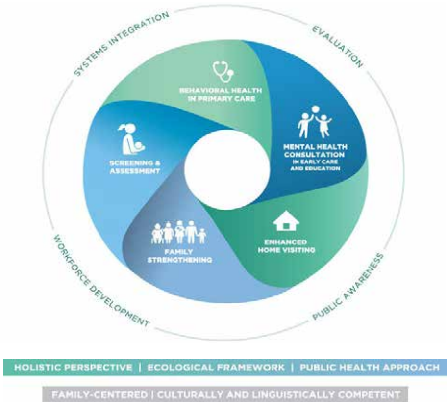
FIGURE 4 The graphic — produced by Project LAUNCH and used by LAUNCH Together — demonstrates both projects’ multi-faceted approach. They increase access to and bolster evidence-based prevention and promotion practices while supporting systems-level integration, workforce training, evaluation, and public awareness. The projects’ five core strategies are represented in the inner circle.