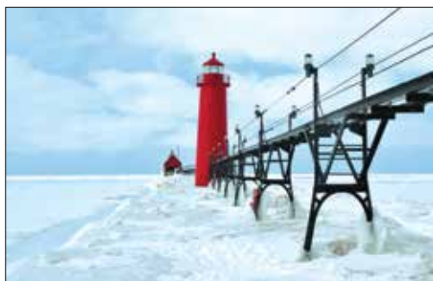
Front cover photo: South Pier Lighthouses on Lake Michigan in Grand Haven, Michigan

The Foundation Review is a proud product of the Dorothy A. Johnson Center for Philanthropy at Grand Valley State University.