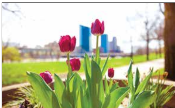
Front cover photo: Spring tulips in downtown Grand Rapids, Michigan

The Foundation Review is a proud product of the Dorothy A. Johnson Center for Philanthropy at Grand Valley State University.