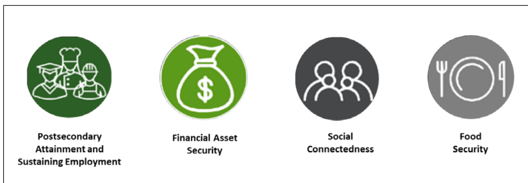
FIGURE 1 Strategic Community Investment Areas

distributed across four key social determinants of health — food security, financial asset security, social connectedness, and postsecondary attainment and sustaining employment. (See Figure 1.) The grants specific to postsecondary attainment and sustaining employment, which occurred in Year 2 of the foundation’s investments and are discussed in this article, are located in Jacksonville, Louisville, Baton Rouge, and New Orleans. The foundation’s intent is to direct investment dollars to the most marginalized demographic and geographic populations, particularly people of color and communities with high concentrations of poverty.