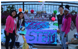
TRIO STEM SSS