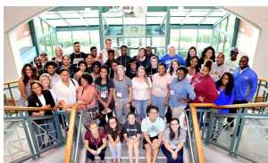
TRIO SSS (Classic)

All TRIO programs have the same ultimate mission to increase rates of academic achievement, retention, and graduation among historically underrepresented students by providing holistic and individualized support services that maximize students' innate abilities, draw upon available resources within and outside of the university, and benefit students, families and the larger community.