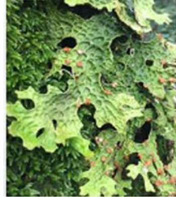
Figure 5. (Porada and Giordani 2021) A foliose lichen ( Lobaria sp.) growing on a tree

vascular epiphytes are not thought to be in competitive equilibrium (described by Watson (1980) as a positive correlation between magnitude of species diversity and environmental complexity), making it easy for new or invasive species to successfully take over an area (Wolf 1995). Non-vascular epiphytes are sensitive to climate change, particularly changes in moisture and temperature (Song et al. 2012). Due to their need to draw moisture from the air rather than through vascular systems, a drier climate could be detrimental to non-vascular epiphyte communities. As such, non-vascular epiphytes in particular could be used as climate change indicators in their environments.