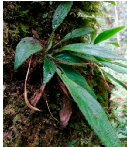
Figure 4. (Zhang et al. 2021) Epiphytic Briggsia longifolia .

independent of hosts in a non-epiphyte form (Zhang et al. 2021; Fig. 4). The community composition of these two types of epiphytes varies slightly. Holo-epiphytes exhibit a vertical gradient where different species can be found at the tops of trees compared to those near the ground. Hemi-epiphyte communities vary more between hosts than on a single host because the host tree's structure is important in determining which epiphyte species take hold there (Nieder et al. 2001).