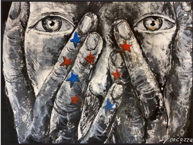
Figure 1 Exposure by Dominic Coccozza, 2018.

Note: Coccozza granted special permission to reproduce this image.