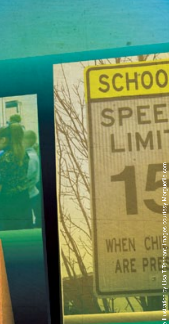
Photo Montage Illustration by Lisa T. Tennant, Images courtesy Morguefile.com

ignores the obvious conflict of values and interests that exists throughout society. Instead, the significance of power and the struggle in social life should be emphasized. Social behavior is best understood in terms of the tension between competing groups. And so rather than interpreting social life as essentially cooperative and harmonious (i.e., a willingness to compromise), conflict theorists view society as an arena or “social battlefield” (Semel, 2010) where different individuals and groups contest one another in order to obtain scarce and valued resources, most of which have economic implications which, in turn, have implications for access to influence in our society and the so-called “levers of power.” If the reader can accept the general assumption that in our economic system, wealth is power, and that we also have a stratified social system (i.e., social classes) that is differentiated primarily by the ability of its members to generate wealth, then it seems fairly reasonable to argue that not all social groups have equal wealth and thus do not have equal access to power. It is not a much greater leap from there to then accept the notion that the interests of those with power don’t necessarily coincide with those lacking that access, and, in fact, may disadvantage the latter on occasion.