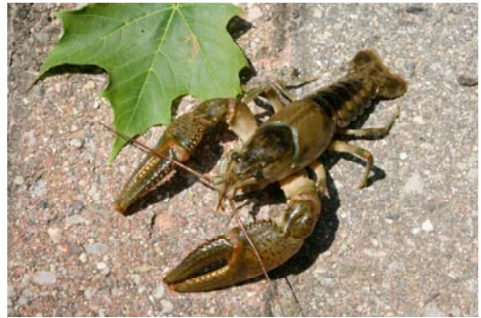
Figure 1. An adult Orconectes propinquus used for the experimental treatments.

Upon hatching the maters were removed and put into a separate tank. Juvenile crayfish were then fed and separated if tanks became overcrowded. Captured male crayfish were kept in isolation as well for their experimental treatments.