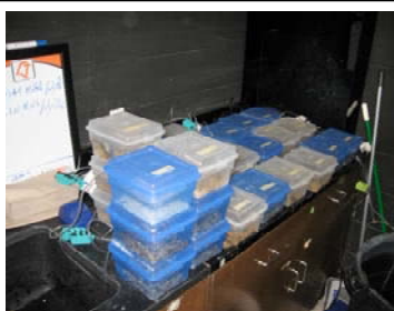
Figure 2. Laboratory set up of adult male crayfish.

Males were placed into isolation tanks with one liter of water, and rocks were placed on the bottom of each tank. Using a pipette (0.2 \mu\text{L} - 2 \mu\text{L} ) the two alkylphenols (nonylphenol and octylphenol), which are known surfactant's were injected into each tank (Fig. 2). The amounts of 0.05 \mu\text{L} , 0.1 \mu\text{L} , and 0.25 \mu\text{L} per liter were used to determine the toxicity of these presumed "inert" ingredients in pesticides (Cox 2003). Also two control groups were used, one with acetone, and the other with de-chlorinated tap water. The reasoning behind the use of