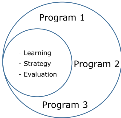
FIGURE 4 Equivalency Model

geographically dispersed evaluation staff into a single unit and integrated other staff to focus on performance and knowledge management. Another variation of this model was seen at the William and Flora Hewlett Foundation, where an effective philanthropy group was formed by centralizing staff and functions related to organizational effectiveness and by hiring an evaluator to supplement the team. (See Figure 4.)