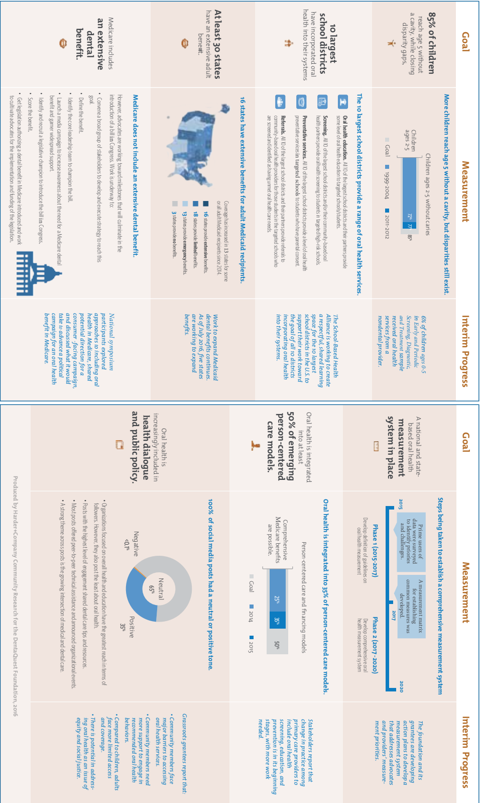
FIGURE 3 Oral Health 2020 Dashboard